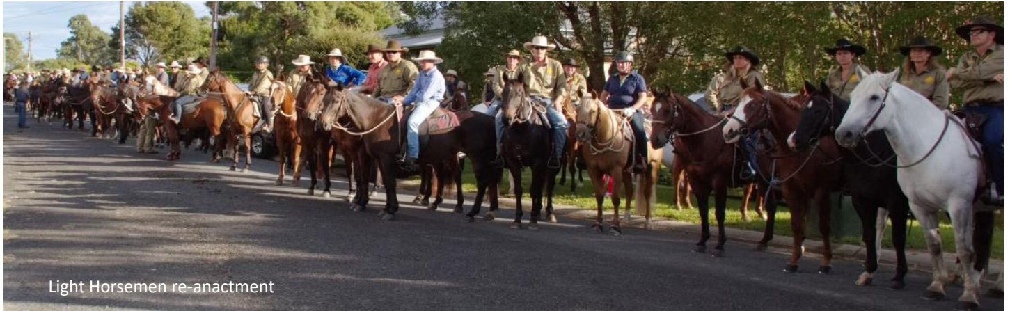
Light Horsemen re-anactment

We acknowledge the elders (past, present and future) of the Ngorabul people.